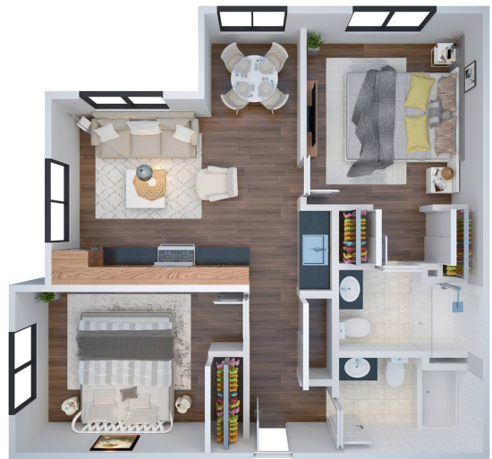
C2 967 SQ FT