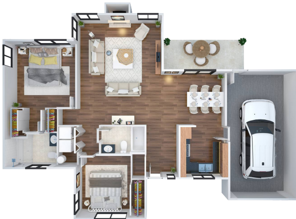
Cottage 1 1,252 SQ FT