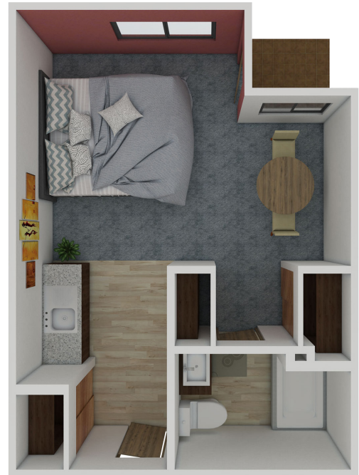
A2 426 SQ FT