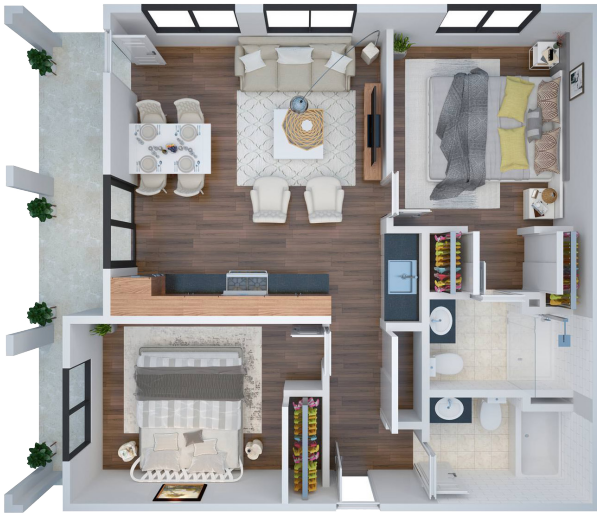
C4 903 SQ FT