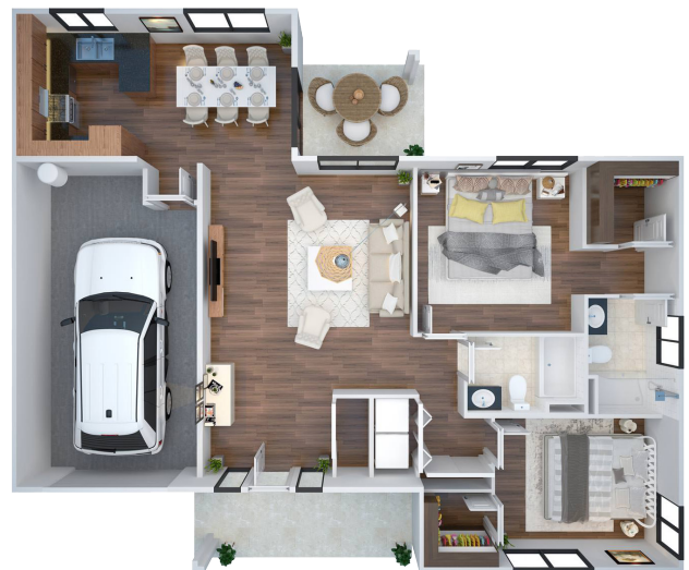
Cottage 2 1,284 SQ FT