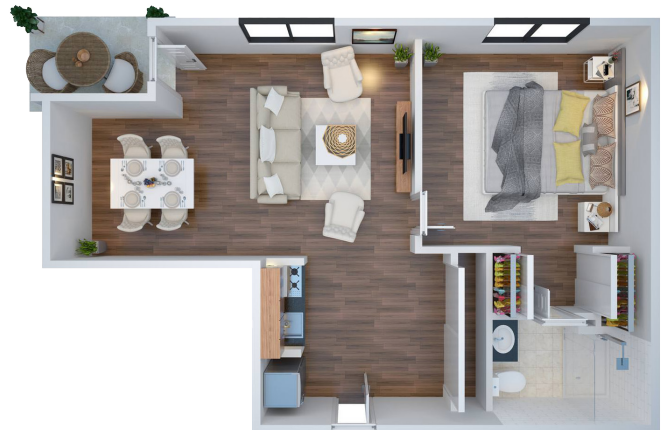
B13 811 SQ FT

Solstice Senior Living at Fairport 55 Ayrault Road, Fairport, NY 14450 (844) 311-0423 SolsticeSeniorLivingFairport.com