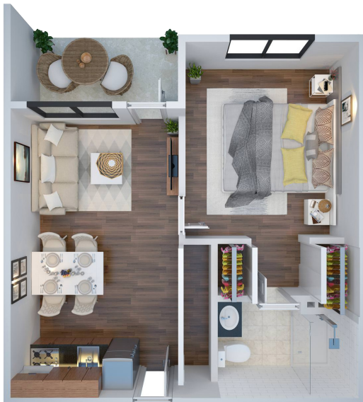
B1 549 SQ FT