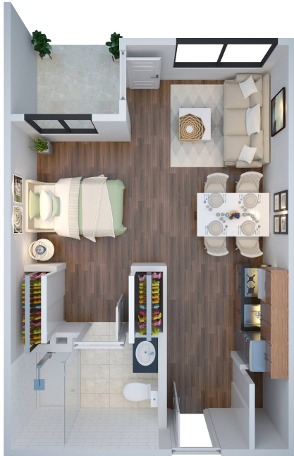
A1 396 SQ FT

Solstice Senior Living at Fairport offers several floor plan choices to suit your needs.