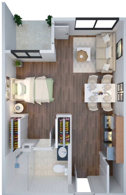
A1 396 SQ FT

Solstice Senior Living at Fairport offers several floor plan choices to suit your needs.